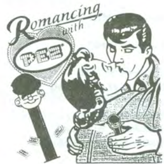
R o m a n c i n g W i t h P e z PEZ006