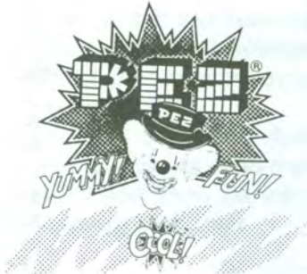
P e z C l o w n PEZ004

BUY ONE, OR BUY THEM ALL. THE DESIGNS ARE GREAT, AND COLORFUL! JUST $17.95 EACH (POSTPAID)