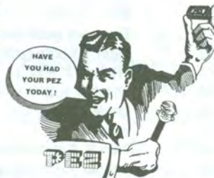
H a v e Y o u H a d Y o u r P e z T o d a y ?