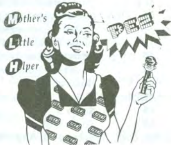
M o t h e r ' s L i t t l e H e l p e r