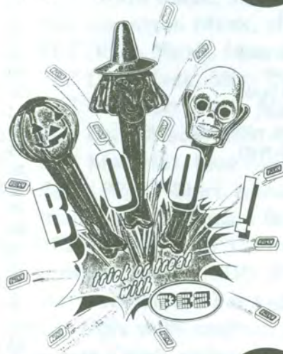
B o o P e z h e a d s PEZ014