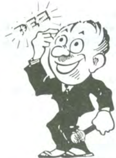
P e z M a n PEZ008