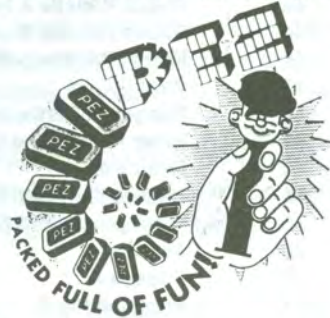
P a c k e d F u l l o f F u n PEZ005