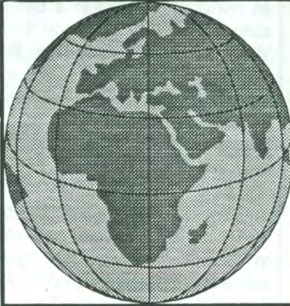
The Plastic Candy Dispenser Newsletter

The course was based on the premise that whatever man creates — be it art, architecture, music, dance, religion, technology or even PEZ reflects something about the society in which it is created. Students applied the concept to the civi-